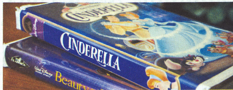
Kathryn Perez — THE BATTALION

"Beauty and the Beast," which was originally released in 1991, will follow in "Cinderella's" footsteps with a modern live-action reboot.