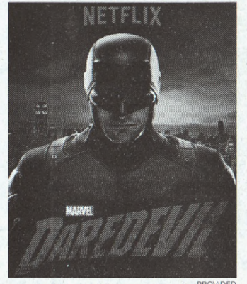
Season two of Netflix's "Daredevil" will likely be released in Spring 2016.

a sweet spot for the theme of, "the power of press," the show invites you to examine our own media with a more critical lens. The idea that "Daredevil" raises is as follows, there are two sides to every story, and just because it's printed or reported on the TV doesn't mean it's true. The press serves as a link between the general public and the "higher up," but it doesn't always do a great job of fairly representing both sides. "Daredevil" really examines this, albeit through extremes, but the message is still conveyed. As for next season, "Daredevil's" official Twitter warned fans that, "Fisk was just the beginning" and to be ready to see our sight-challenged hero back in action, facing new foes and enemies. "Daredevil" is another step in the right direction for the Marvel Universe, and all I could think Sunday night is how much I really wished I had another episode to watch. Season two being con-