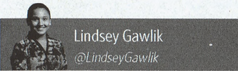
Lindsey Gawlik @LindseyGawlik

Women should be given better examples of how to respect their bodies