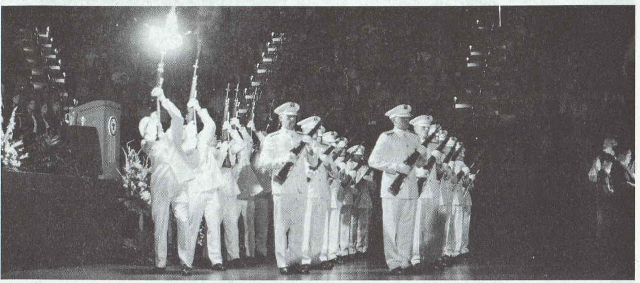
(Top) Family members to the 2014 Muster honorees light candles as the names are called. (Bottom) The Ross Volunteer Firing Squad fires three volleys of seven shots during the 2014 Muster ceremony.