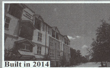
Built in 2014