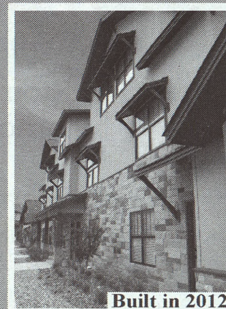
Built in 2012

WORTH RESIDENTIAL 979-703-8925 info@worthres.com