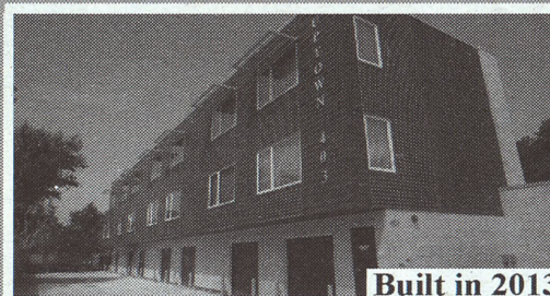
Built in 2013

Sierra, Uptown & Northgate Proper have beautiful high end finish outs including: granite, wood vinyl flooring, stained concrete flooring, utility packages, assigned parking per bedroom at no additional cost and many more. (*each property differs and Tenant will need to get full details on each from Leasing Office)