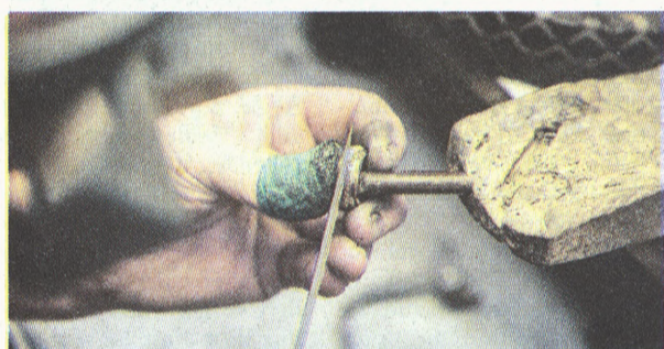
REMASTERED: The Battalion follows the Aggie Ring repair process from the Austin Balfour factory.