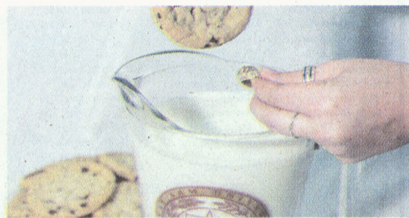
BEYOND BEER: Aggies weigh in on a few ring dunk alternatives for those who want variety.