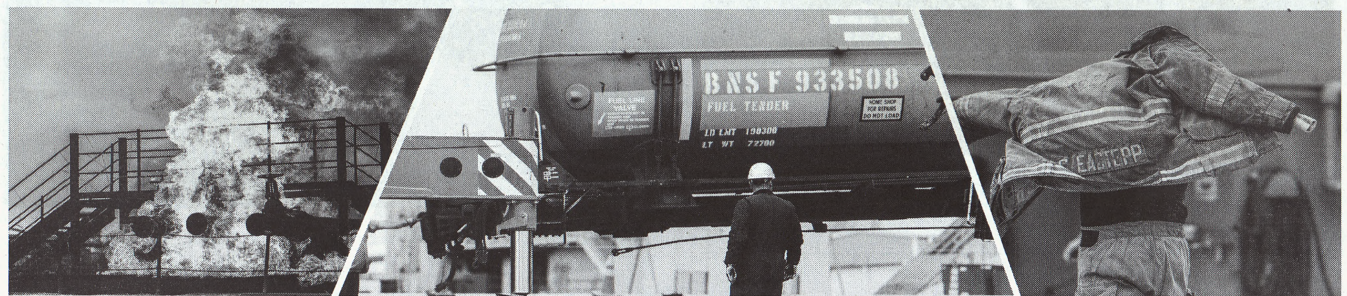
The Brayton Fire Field prepares first responders for disaster situations, with simulated fires and other incident recovery scenarios. The 2015 spring training hosted about 500 students, many from other states or countries.