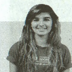
Katie Canales @KatieCanales1

Film's characters digress from typical high school stereotypes