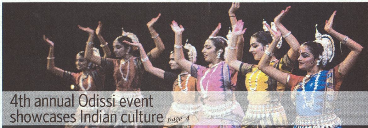
4th annual Odissi event showcases Indian culture page 4