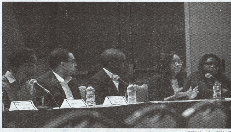
The "State of the Black Aggie" symposium was intended to address concerns of black students.