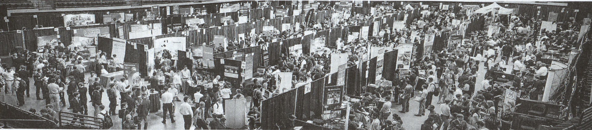
A packed Reed Arena at the Fall 2014 Engineering Career Fair sets the tone for the upcoming spring fair.