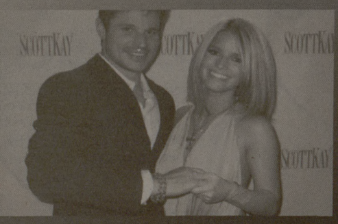
Jessica Simpson, Nick Lachey, Gwyneth Paltrow, Halle Berry and Michael Jordan are a few celebrities who wear Scott Kay designs.