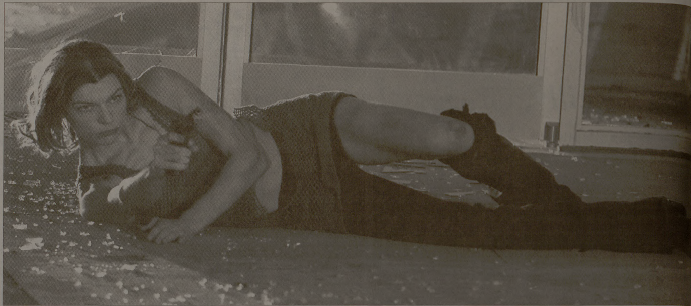
In "Resident Evil: Apocalypse," Milla Jovovich returns as Alice, who must fight for her life among swarms of bloodthirsty Undead.