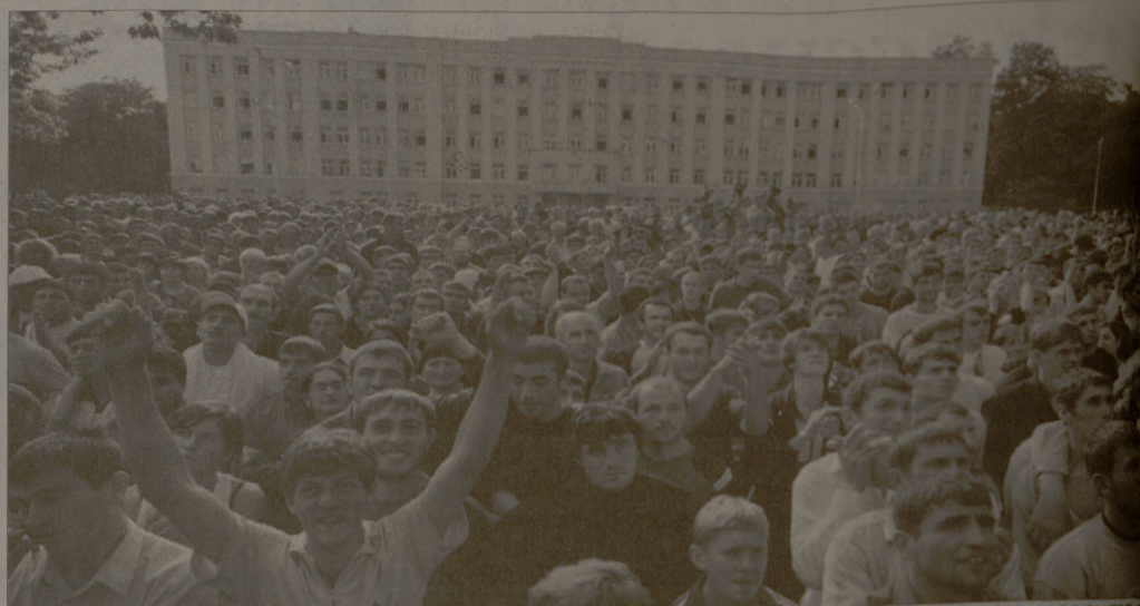
People react during a meeting with President of North Ossetia Alexander Dzasokhov who spoke from a balcony of a regional administration headquarters