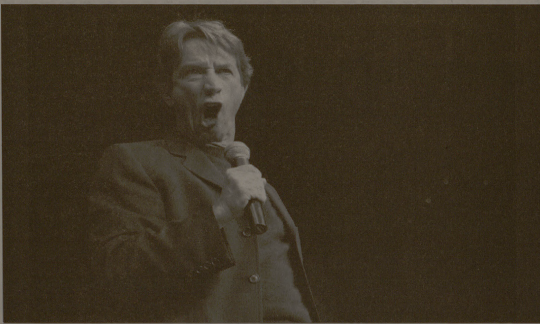
Actor/comedian Martin Short greets the audience at First Yell 2002. Actor/comedian Bill Cosby will return for his second visit to Aggieland as the headlining performer for First Yell 2004, which will begin at 8 p.m. Friday in Reed Arena.