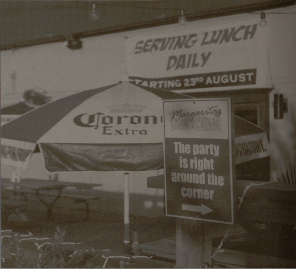
Margarita Rocks is open from 11 a.m. to midnight Sundays through Tuesdays and 11 a.m. to 2 a.m. Wednesdays through Saturdays.