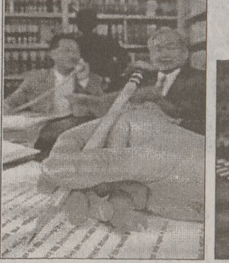
Free Resume Reviews