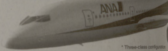
Model of 7E7 Dreamliner passenger jet

All Nippon Airways (ANA) ordered 50 Boeing 7E7 Dreamliner passenger jets to be delivered in 2008. It was the first order for the new plane — designed to compete with the Airbus A330-200.