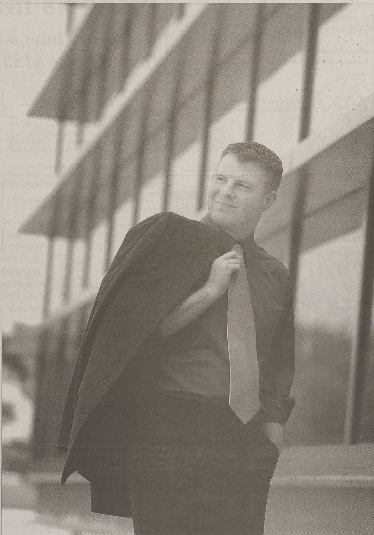
JOHN C. LIVAS • THE BATTALION

For a very formal daytime wedding, a very dark, conservative three-piece suit is best, and a dark, three-piece suit is appropriate for both semi-formal daytime and informal daytime weddings, as reported on the Web site. For a very formal evening, men should wear black tuxedos, and for semi-formal and informal evening events a dark suit is also best.