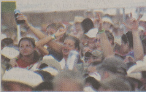
GRAPHIC BY: RUBEN DELUNA • THE BATTALION