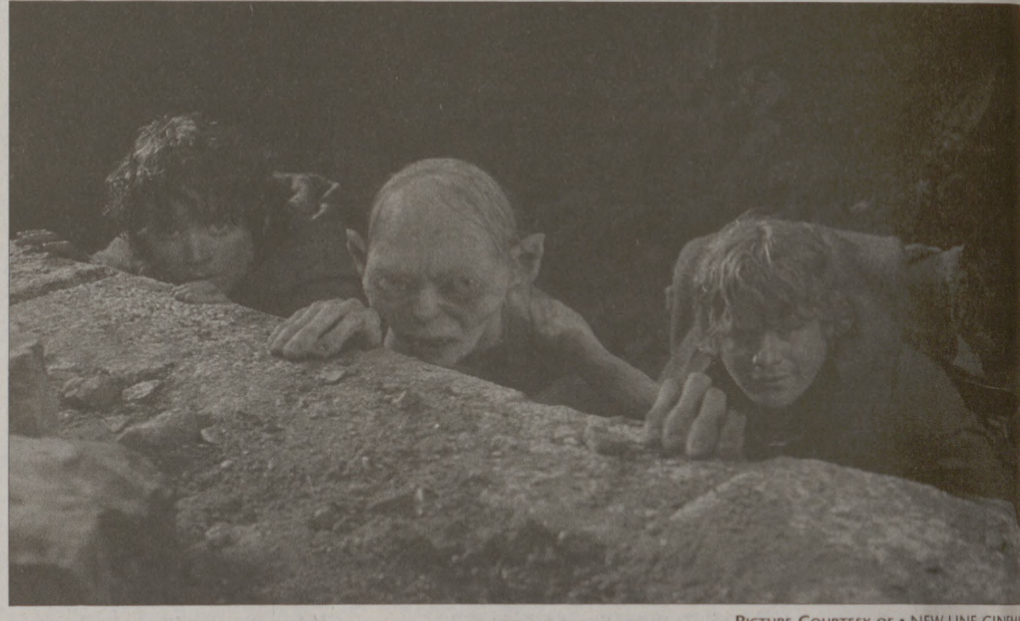
Frodo Baggins (Elijah Wood, left) and Samwise Gamji (Sean Astin, right) wait on Mt. Mordor as Gollum (Andy Serkis, center) awaits to take them inside the cave of Shelob. The scene inspired the song "Shelob's Lair."