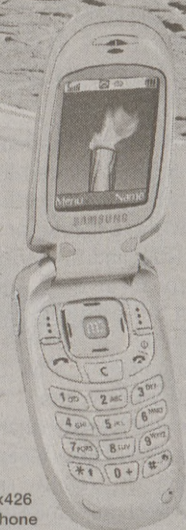
Samsung x426 Wireless Phone

Samsung has just put you in the running to carry the torch.