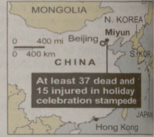
At least 37 dead and 15 injured in holiday celebration stampede

"One person fell down on a grate in the park and caused