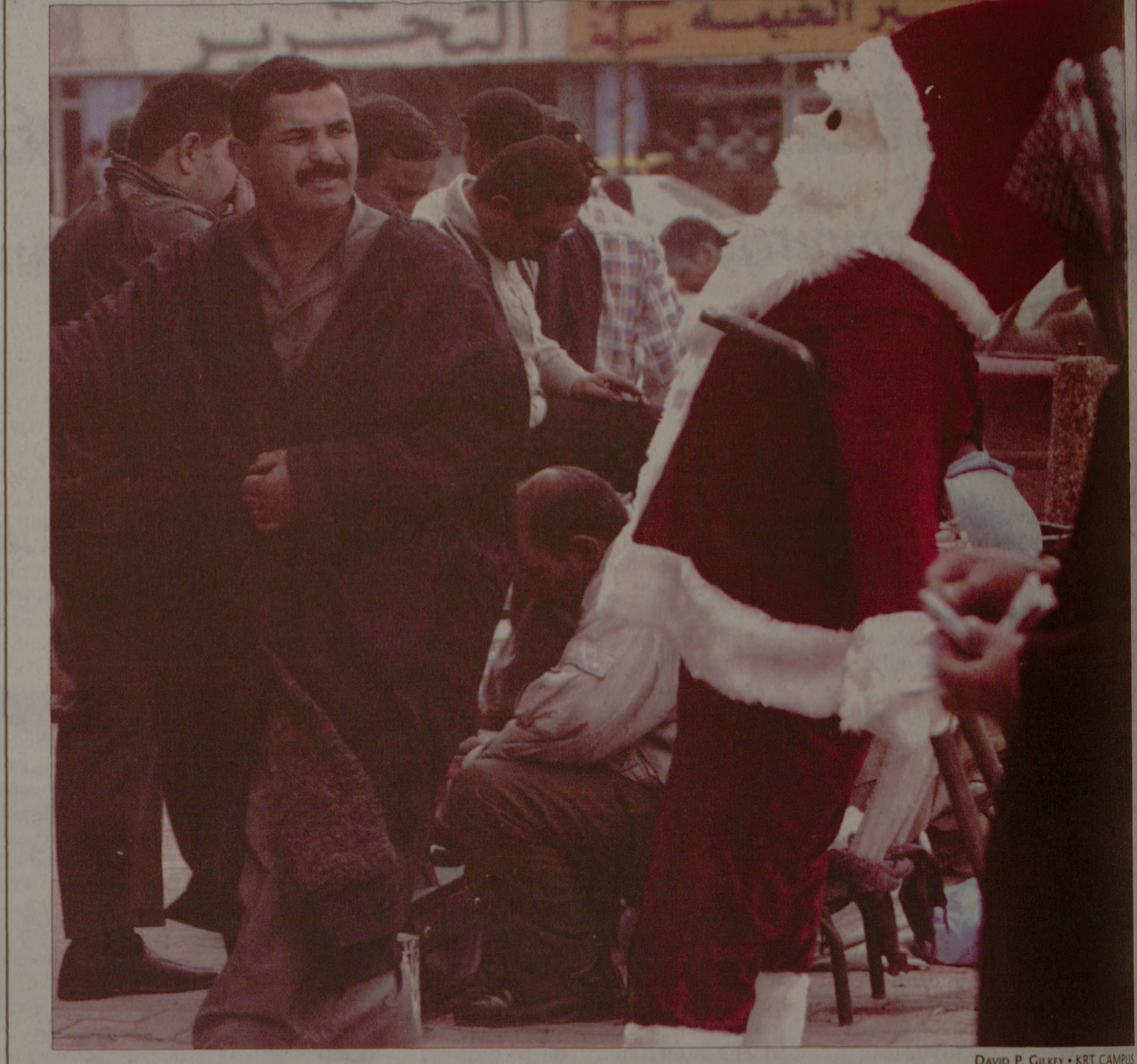
A foam padded Santa Claus suit draws the curious eye of passers by in Tahir Square in downtown Baghdad, Iraq, Monday, Dec. 1, 2003. The Santa suits are handmade in Baghdad and can be either worn as a costume or left out as a decoration.