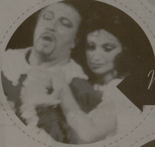
Meet THE COUNTESS , admirer of The Duke.