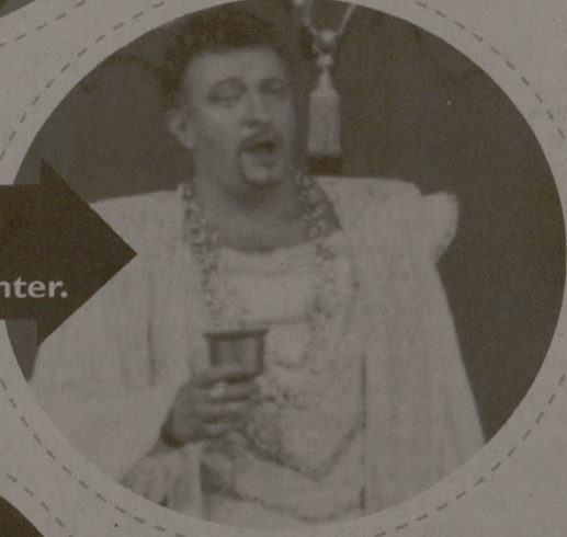
Meet THE DUKE , admirer of Rigoletto's daughter.