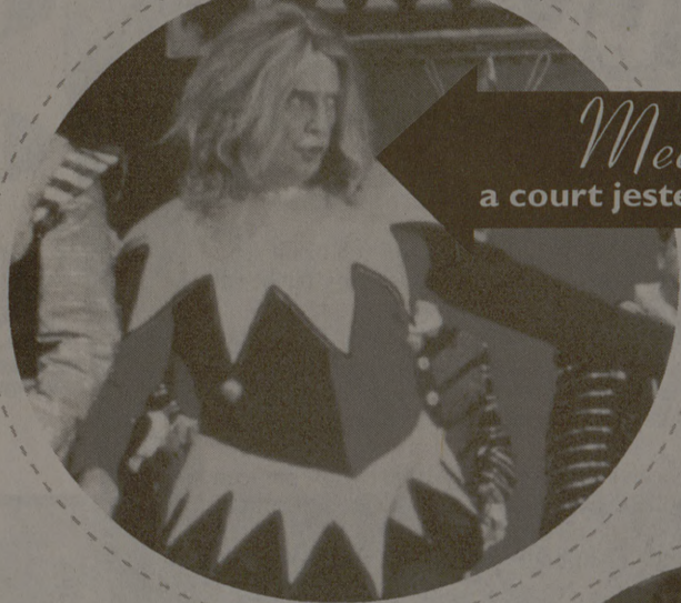
Meet RIGOLETTO , a court jester and star of our show.