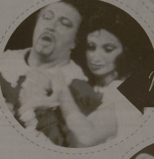
Meet THE COUNTESS , admirer of The Duke.