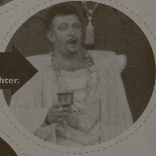
Meet THE DUKE , admirer of Rigoletto's daughter.