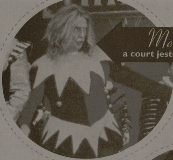
Meet RIGOLETTO , a court jester and star of our show.