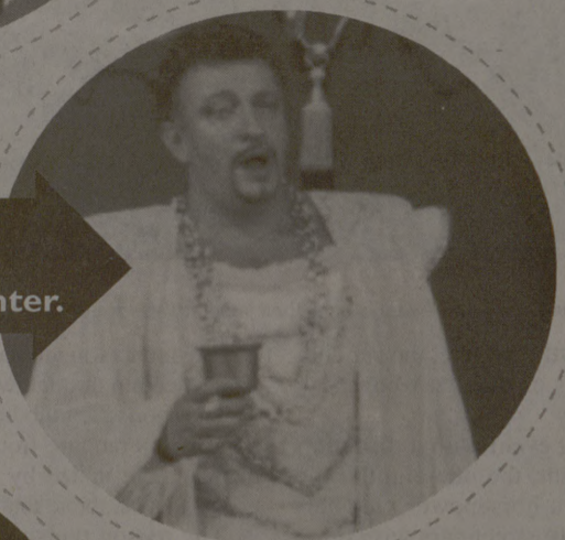
Meet THE DUKE, admirer of Rigoletto's daughter.