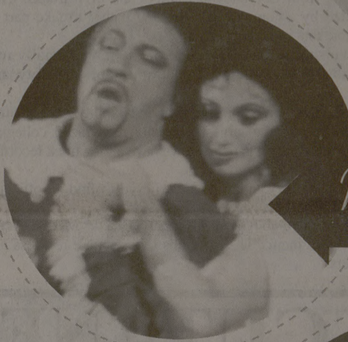
Meet THE COUNTESS, admirer of The Duke.