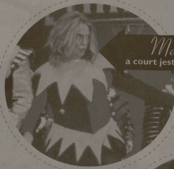
Meet RIGOLETTO , a court jester and star of our show.