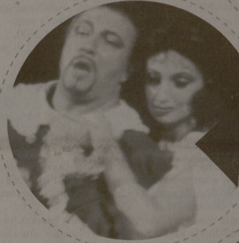
Meet THE COUNTESS , admirer of The Duke.