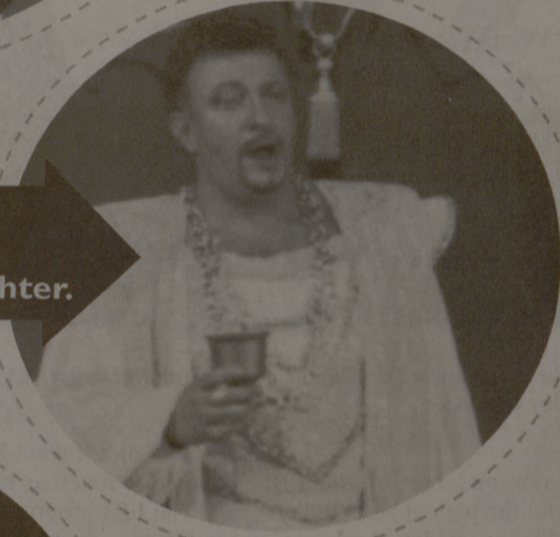
Meet THE DUKE , admirer of Rigoletto's daughter.