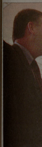
Interim Vice President A&M President Re open forum discuss