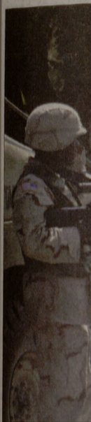
Soldiers guard the soldier was critic