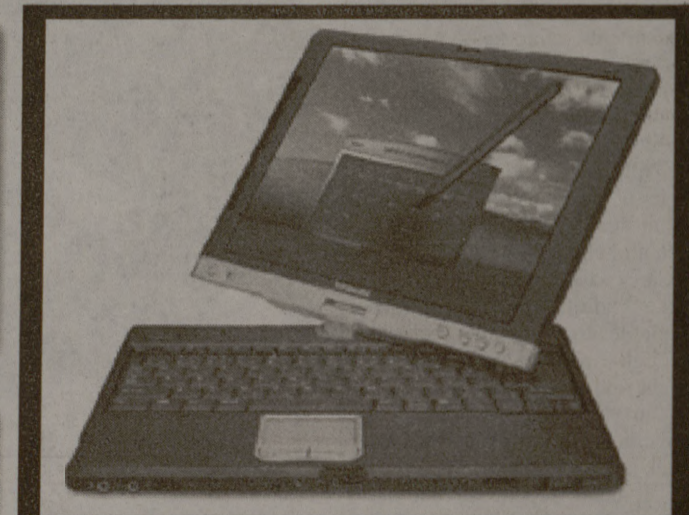
Top Left: Microsoft Office OneNote 2003 screen shot

record "audio notes" using OneNote. With the click of a button, audio is recorded by the computer's microphone, like a conventional tape recorder. The audio is in sync with the text typed during the recording, so the user can click on any line of text and the audio will play back from the specific point when