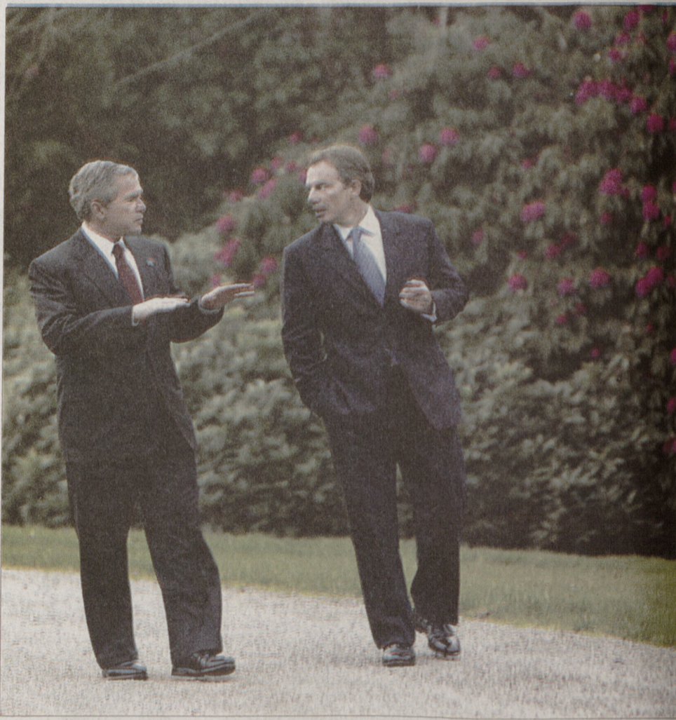
President George W. Bush, left, and British Prime Minister Tony Blair walk through the grounds of Hillborough Castle in Northern Ireland this week. The two discussed progress in the war on Iraq.