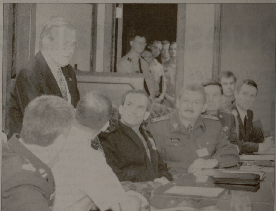
Secretary of Defense Donald H. Rumsfeld speaks to defense attachés and representatives of 26 of the Operation Iraqi Freedom coalition nations gathered at the Pentagon for a meeting on Thursday. Operation Iraqi Freedom is the multinational coalition effort to liberate the Iraqi people, eliminate Iraq's weapons of mass destruction and end the regime of Saddam Hussein.