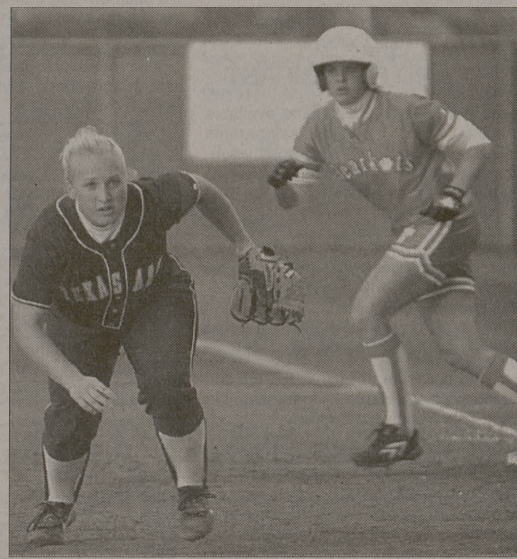
JOHN C. LIVAS • THE BATTALION

"We were a little flat in the first game," Slataper said. "I needed to come out and throw strikes, but (scoring 11 runs) makes you breathe a little easier."