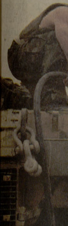
U.S. Marine Sgt. L the north of Iraq o

American infan off a desert att Tuesday, inflictin in a clash less th Baghdad. British