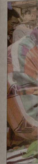
(Top) Iraqi are stocking view of the