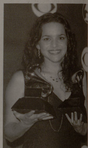
Norah Jones took home seven awards at Sunday night's Grammys.

Country singer Alan Jackson, who wrote "Where Were You (When the World Stopped Turning)" in the weeks after the terrorist attacks, won best coun-