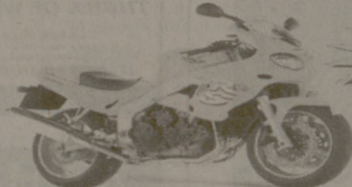
Triumph® 955 Sprint RS