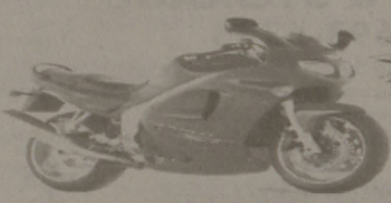
Triumph® 955 Sprint ST