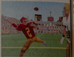
Must turn off "Injuries" for the thin Trojans to succeed. Controlling the playbook is crucial with USC's quarterback.