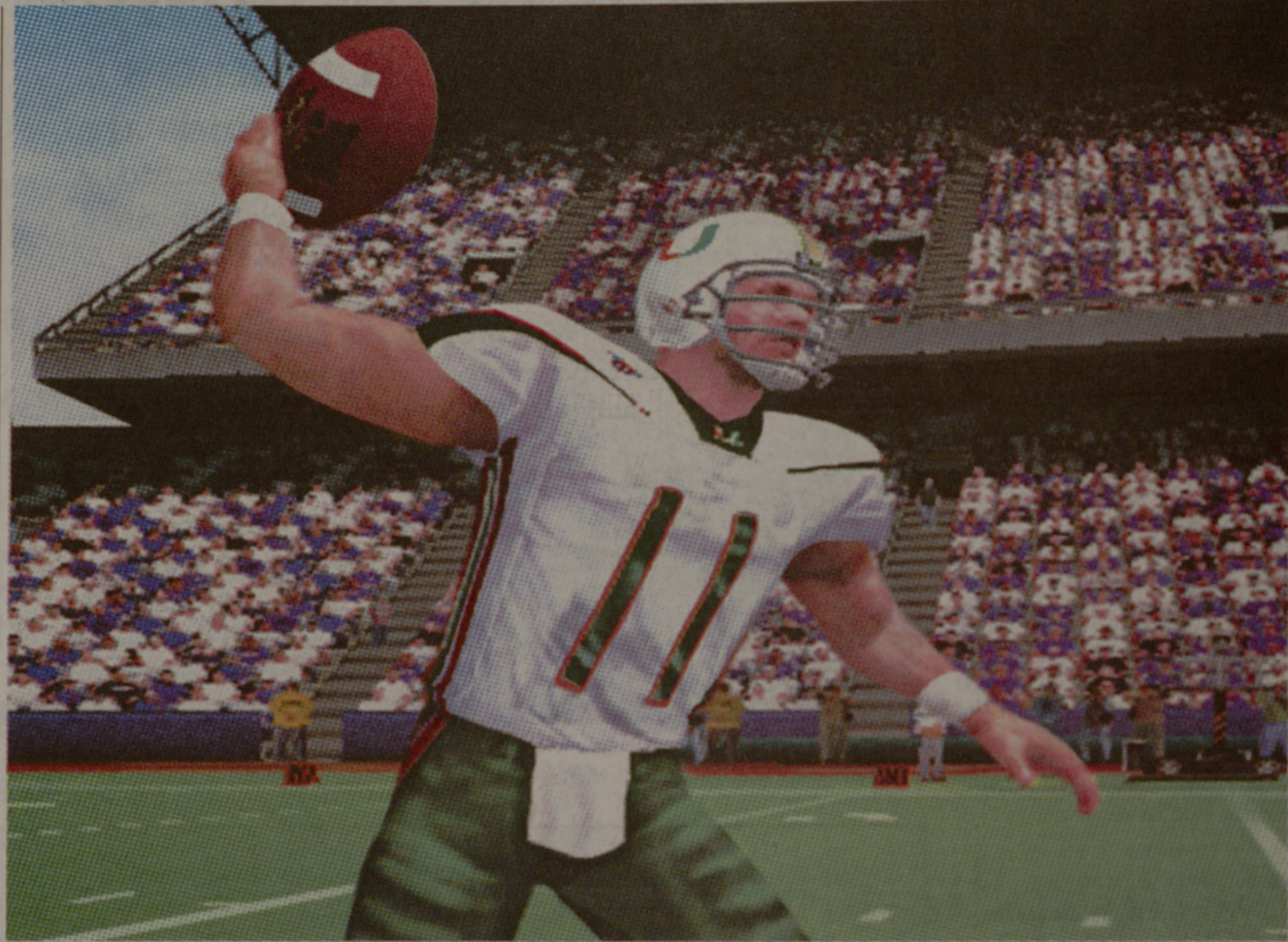
Can the 'Canes repeat? Can the Sooners make it two out of the last three? Who will win the Heisman? How many polygons does a Butkus Award winner get? Where is Berkeley? The answers to these (No. No. Look to Texas. Thousands. Take I-80 west and follow the signs.) and other pressing questions can be found in this year's College Football Top 25 poll: