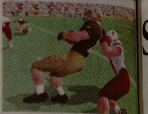
Just avenge the CU mauling and beat the Oklahoma Sooners, all to be right in Huskerland.