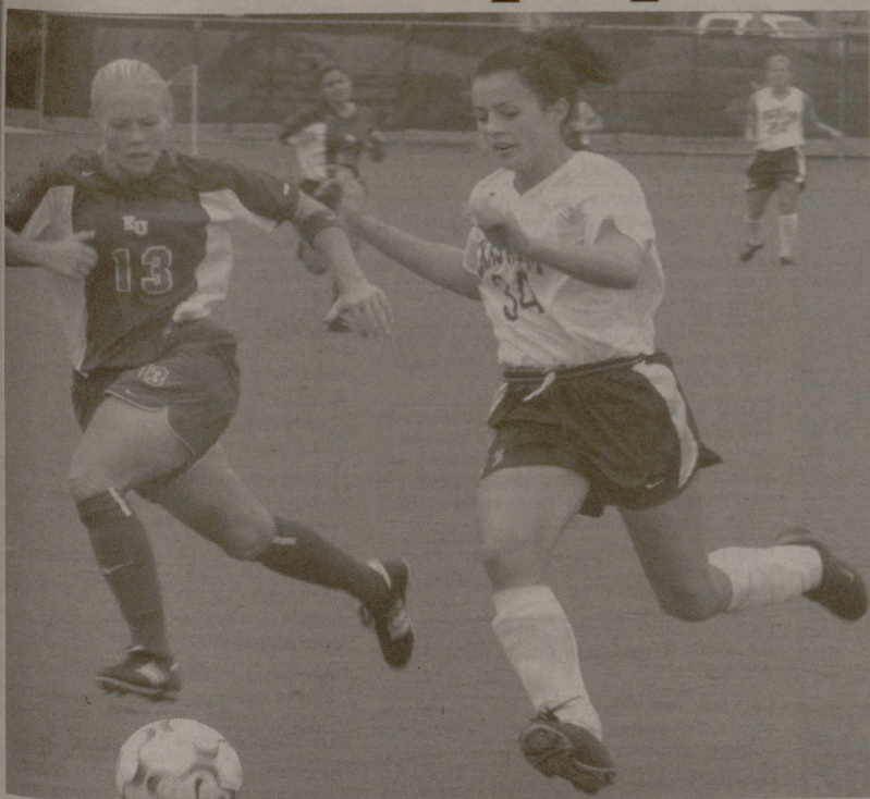
ALISSA HOLLIMON • THE BATTALION

In this "Battle for the Big 12" the Aggies hope history stays on their side.