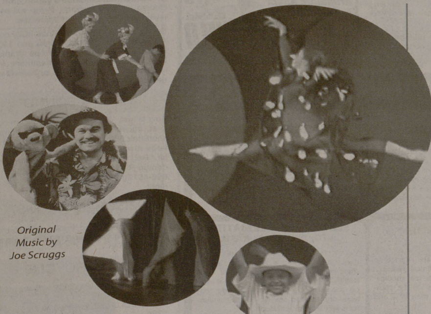
Original Music by Joe Scruggs