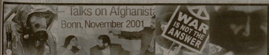
Talks on Afghanistan Bonn, November 2001