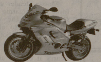
Triumph® TT 600