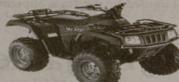
Artic Cat® 500i 4x4