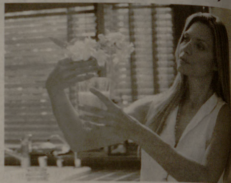
Michelle Pfeiffer stars as Ingrid, a brilliant poet created for killing her lover, in White Oleander.

Most of the darker parts of the book have been brightened up, making the movie feel shallow. Interesting themes are still here -