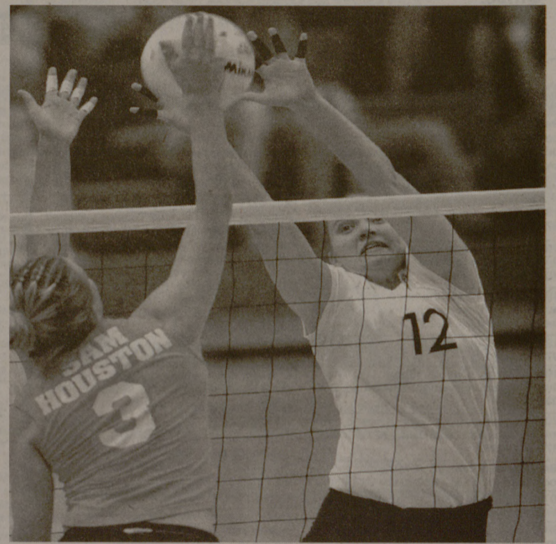
JOHN C. LIVAS • THE BATTALION

The match is scheduled to tip-off at 7 p.m. from the Hearnes Center.