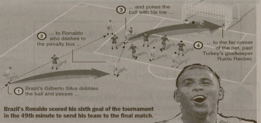
Brazil's Ronaldo scored his sixth goal of the tournament in the 49th minute to send his team to the final match.

Four-time champion Brazil defeated Turkey and battles three-time champion Germany in the World Cup final on Sunday in Yokohama, Japan. Turkey will face South Korea for third place on Saturday in Daegu, South Korea.