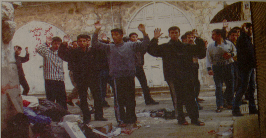
Palestinians surrender to Israeli forces in the West Bank city of Nablus Tuesday.