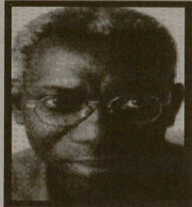
Yusef Komunyakaa Pulitzer Prize Veteran of the Vietnam War

Two American War Veterans / Two Prize-Winning Writers