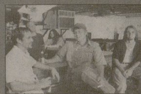
CROSS CANADIAN RAGWEED PLAYING AT 12:30

TICKETS AVAILABLE: AGGIELAND OUTFITTERS, THE TEXAS STORE, & INSPIRATIONS IN THE MALL, CATALENA HATTERS IN BRYAN, THE EXCHANGE AT LUTHER STREET, AGGIELAND OUTFITTERS AT SOUTHGATE, & TICKETWEB.COM