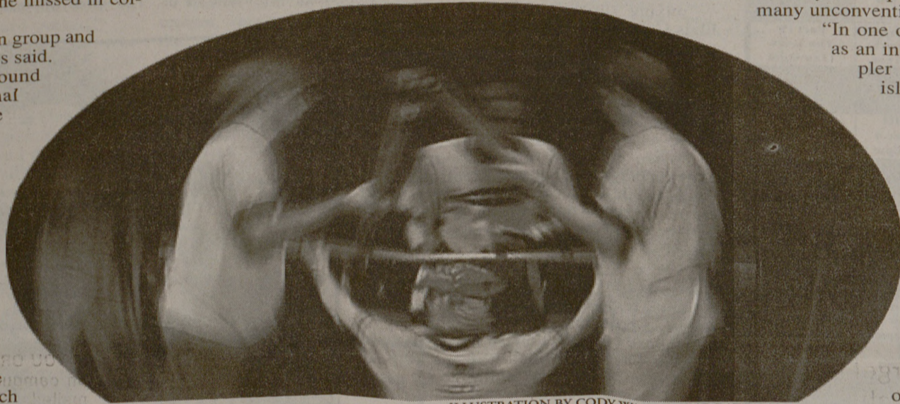
ILLUSTRATION BY CODY WAGES • THE BATTALION

When the members of Percussion Studio take stage, the audience is often surprised how detailed each drum piece and performance is.