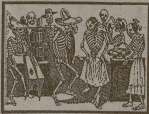
Jose Guadalupe Posada

Thursday, November 1, 2001 Rec Center, Rm. 281 8:00 pm