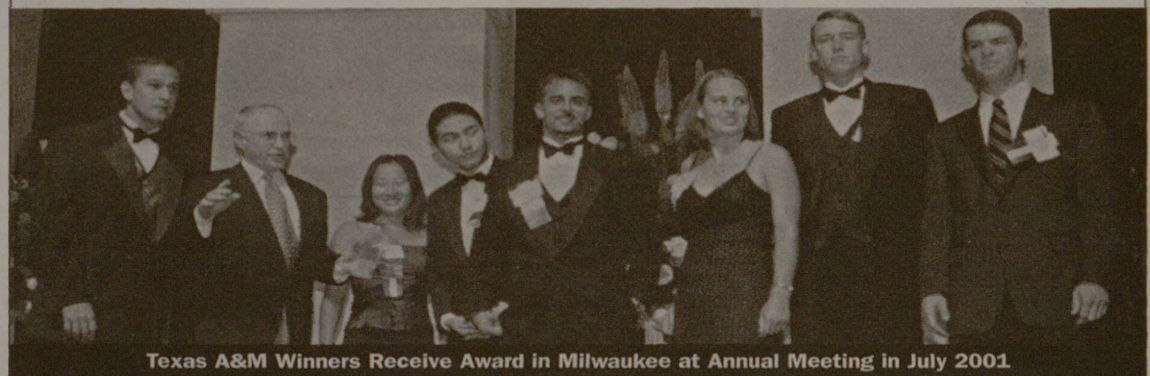
Texas A&M Winners Receive Award in Milwaukee at Annual Meeting in July 2001

to our Aggie Financial Representative Interns