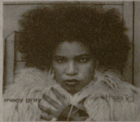
Macy Gray

Macy Gray's wearable advertisement at the "MTV Video Music Awards" may have been undeniably tacky, but anyone who followed the instructions written in masking tape on Gray's dress and bought her newest CD has found that she was giving great advice.