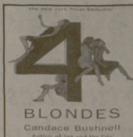
Four Blondes Candace Bushnell Grove Press Books

This is a definite must-read for readers of all ages. (Grade: A)